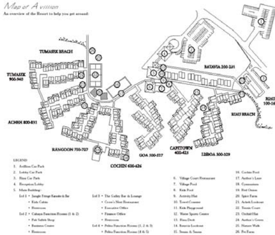
Map of Avillion An overview of the Resort to help you get around

Avillion Port Dickson is in essence designed along the concept of a traditional Malay Fishing Village. The architecture and furnishes manifest the influence of Malay culture combined in an eclectic mood.